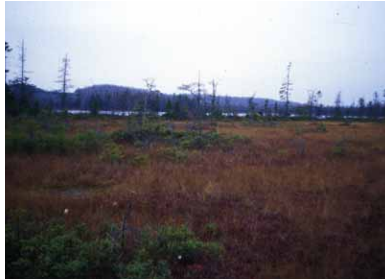
The Wendy O'Neil Memorial Preserve is also known as Mud Lake Bog.